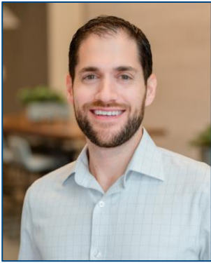
Managing Partner Tampa