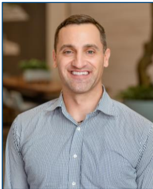
Vice President of BD Charlotte