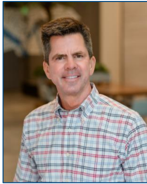
Managing Partner Tampa