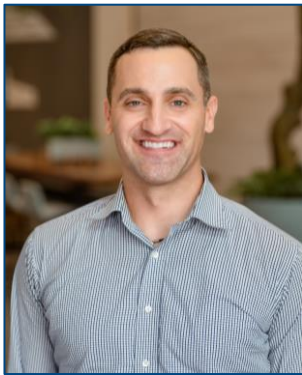
Vice President of BD Charlotte