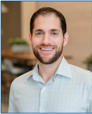
Managing Partner Tampa