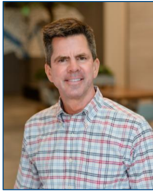
Managing Partner Tampa