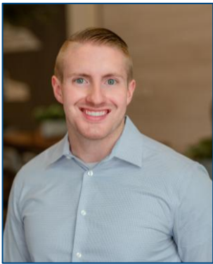
Senior Associate Tampa