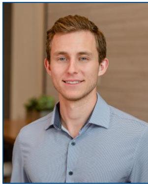
Senior Analyst Tampa