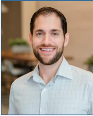
Managing Partner Tampa