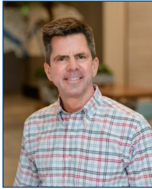
Managing Partner Tampa